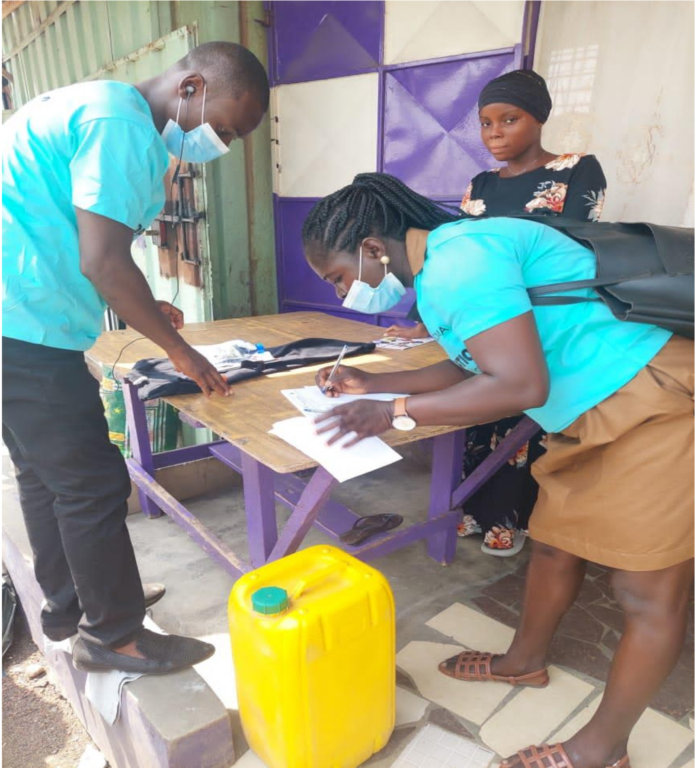
Picture 4: officers serving notice to an offender during the exercise